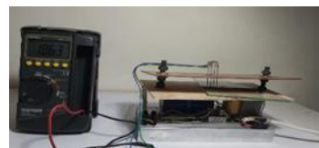
Figure 6. Biocomposite resistance value measurement 2

biocomposite 2, the conductivity value is lower than that of biocomposite 2.