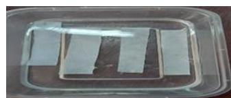
Figure 1. Cellulose Bacterial Pellicle in Acetone

The nata de coco sheets were cleaned using distilled water. Then the nata de coco was soaked in 5% NaOH solution for 24 hours. After that, the nata de coco was rinsed with distilled water to pH 7. Next, the nata de coco was cut and ground into a size of 10 cm long, 1.5 cm wide and 1.2 mm thick. Then soaked in acetone.