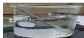
Figure 2. Cellulose bacteria pellicle in TEMPO . solution

Prepare the Cellulose Bacterial pellicle in acetone. Then stirred 100 ml of distilled water, 0.016 g TEMPO, 0.1 g NaBr for 30 minutes at 350 rpm. Furthermore, the cellulose bacterial pellicle was added to the solution, then the speed was lowered at 200 rpm for 10 minutes. Next, add 1.64 g of NaClO so that the pH becomes 10, then rotate for 15 minutes at a speed of 200 rpm at a temperature of 70° C. Then the Bacteria Cellulose pellicle is boiled in a solution for 40 minutes at a temperature of 70° C, then cooled. Then 5M HCL was added so that the pH was 7. Finally TEMPO Bacteria Cellulose was dried in an oven at 50°C for 2 hours.